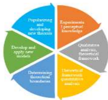
Figure (1) The Multi-Level Design of Experimental Project

Study of Zhao (2021) aimed to improve the teaching system of basic mechanics experiments to support building a high-level university and training excellent engineers. The result is Principles, practical measures, and an assessment index system were explored to design a multidisciplinary teaching system for basic mechanics experiments, helping students actively analyze and solve problems and deepen their understanding of professional knowledge.